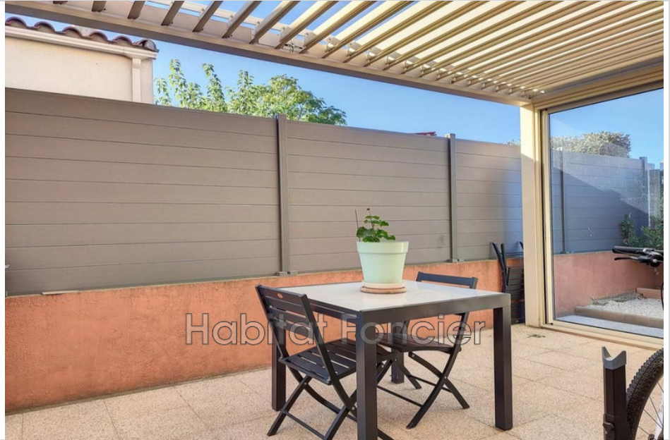
House 1720 Rigarda

In Rigarda, in a well-located residential area, a single-storey T4 house of approximately 79m 2 , on 3 sides, with garage, on a plot of 228m 2 . Including: _ a living room / equipped kitchen _ three rooms _ a bathroom _ a separate toilet _ a fitted garage _ a parking space _ a garden with terrace and bioclimatic pergola Double glazing, electric roller shutters, solar panels. Property tax: €1,261 Selling price, agency fees, buyer's charge included: €245,000 Agency fees charged to the seller: €10,000 including tax Net seller selling price: €235,000 Real estate diagnostics currently being developed. For more information, I am at your disposal.... Radek NOWAK 07.76.96.16.45 Email: r.nowak@habitatfoncier.fr RSAC commercial agent n° 892 847 856 from Perpignan HABITAT FONCIER Agency 43bis, Promenade Côte Vermeille 66140 Canet en Roussillon